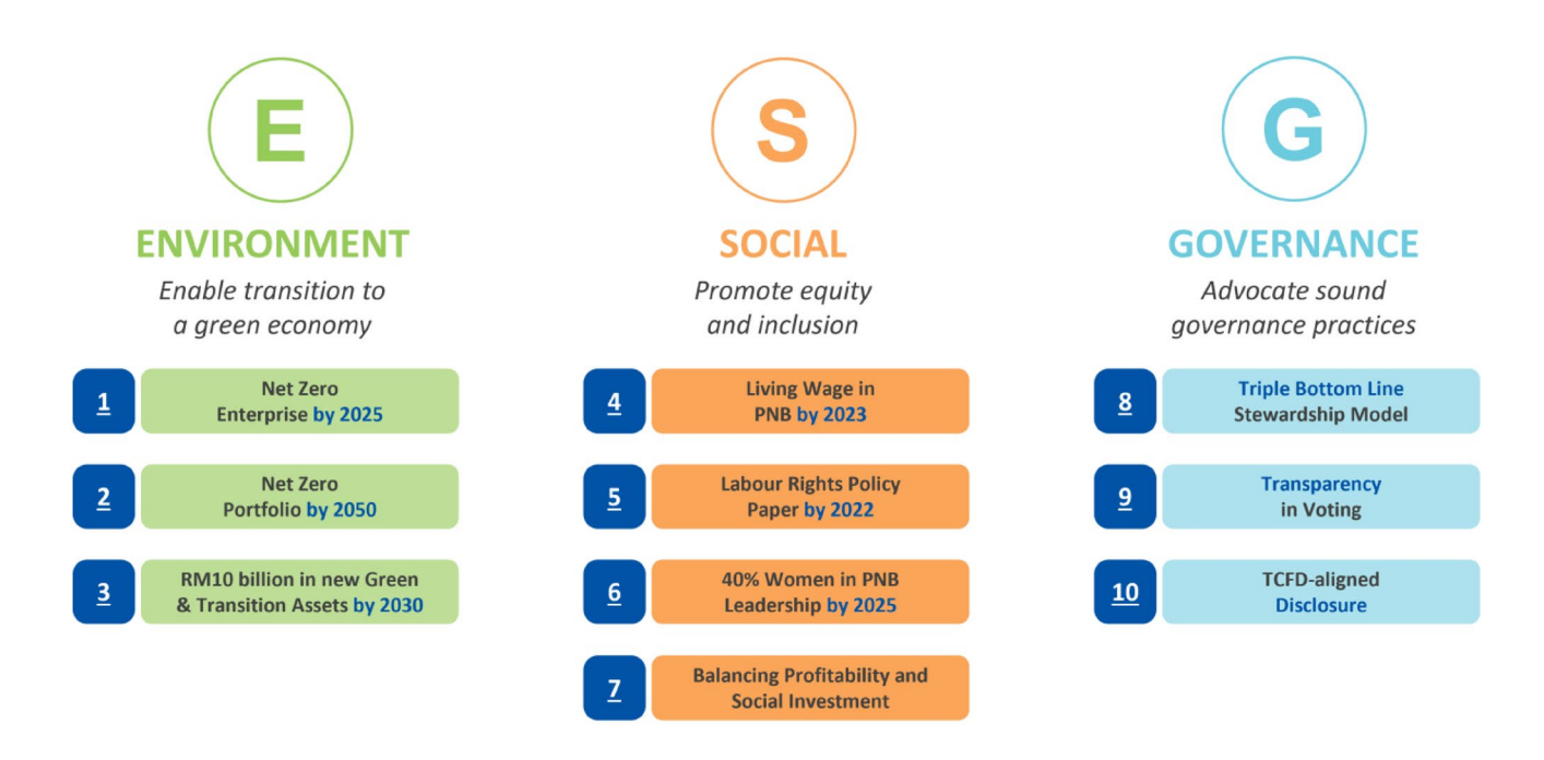
Exhibit 1: PNB's Ten (10) ESG Commitments