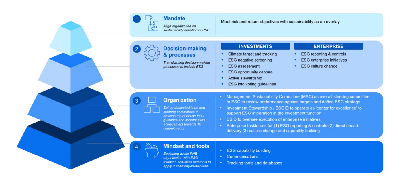
Exhibit 2: PNB's Sustainability Approach

We are embedding ESG considerations into all parts of the organisation (Exhibit 2). Embedding ESG into all processes of decision-making allows us to augment our efforts in identifying opportunities for value creation and managing ESG risks.